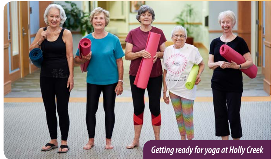
Getting ready for yoga at Holly Creek

Cappella is the consulting and management division of Christian Living Communities (CLC). Established in 1972, CLC owns and operates highly successful Life Plan communities, Assisted Living, Adult Day and Home Care Services in the Denver metro area.