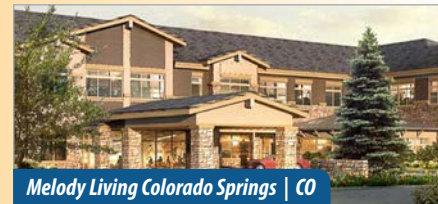
Melody Living Colorado Springs | CO