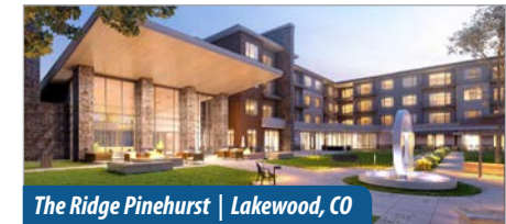
The Ridge Pinehurst | Lakewood, CO