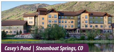
Casey's Pond | Steamboat Springs, CO