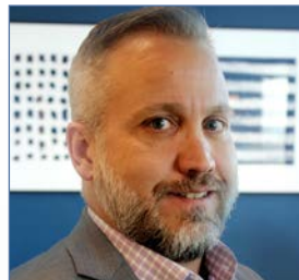
Swimming at Holly Creek