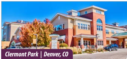
Clermont Park | Denver, CO