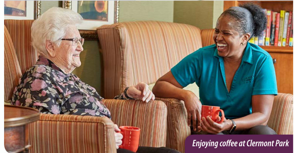
Enjoying coffee at Clermont Park