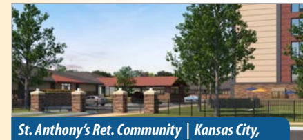
St. Anthony's Ret. Community | Kansas City,