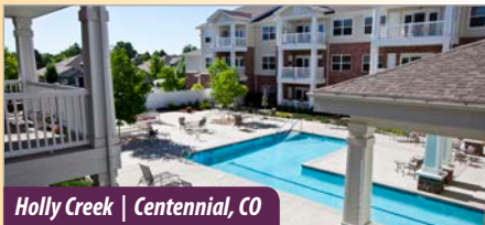
Holly Creek | Centennial, CO