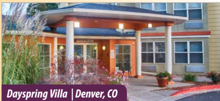
Dayspring Villa | Denver, CO