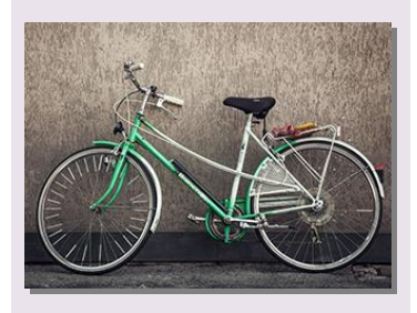
In 2015, nearly 150 people gathered at the Basilica of Saint Mary for the Blessing of the Wheels.