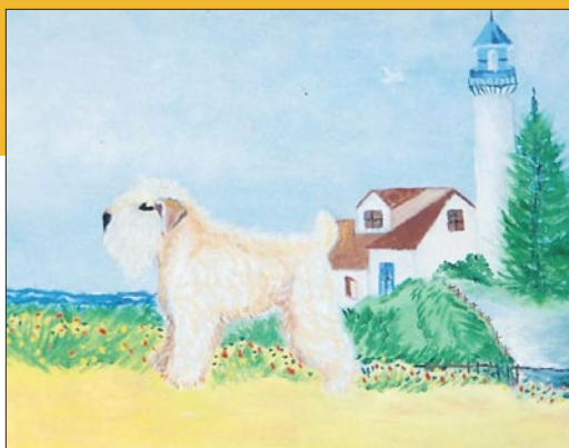
Beach Illustration by Syd

To learn about support groups, services, research centers, clinical trials, and publications about AD, contact the following: