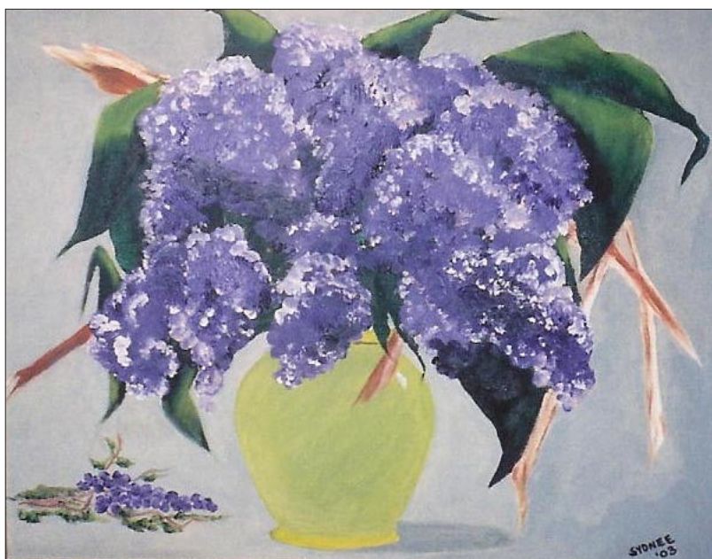
Flowers Illustration by Syd