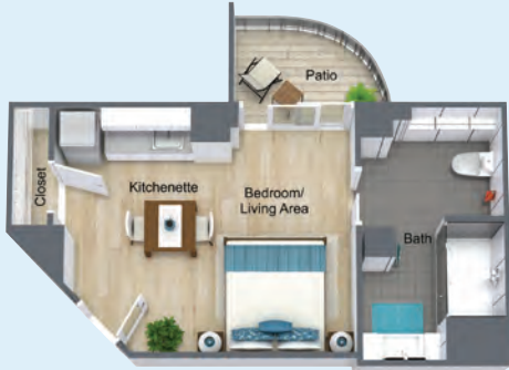
THE HAYWORTH Private Studio