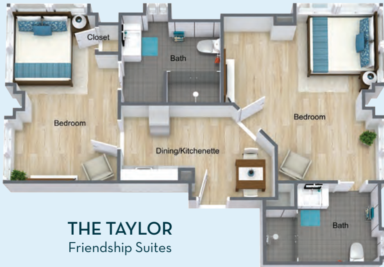
THE TAYLOR Friendship Suites