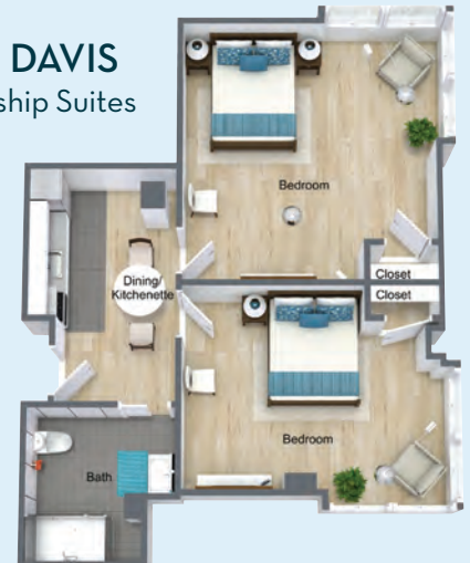
THE DAVIS Friendship Suites