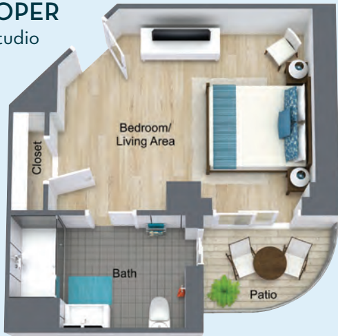
THE COOPER Private Studio