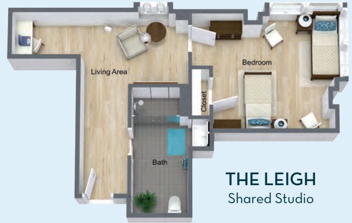
THE LEIGH Shared Studio