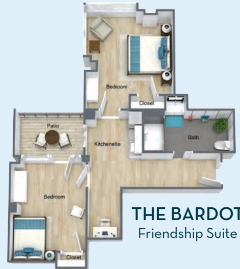
THE BARDOT Friendship Suite