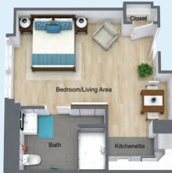
THE ROGERS Private Studio