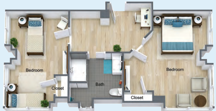
THE HARLOW Two-Bedroom Companion and Friendship Suites