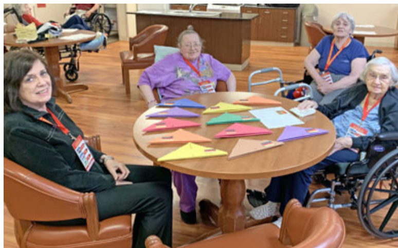
We made our German Alpine hats and flower crowns for our Oktoberfest Party.

It was a very exciting day as the Arbor residents boarded the Hawthorn Express Train to experience Germany, France, and Italy. With Passports in hand, we were full steam ahead!