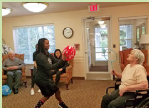
Badminton Balloon time in Arbor