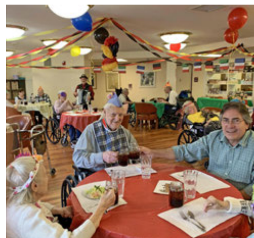
Cheers to our fun Oktoberfest!