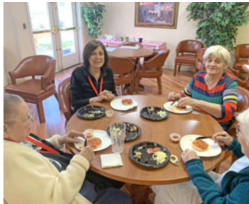
In Italy, we made small muffin pizzas with our own sauce.