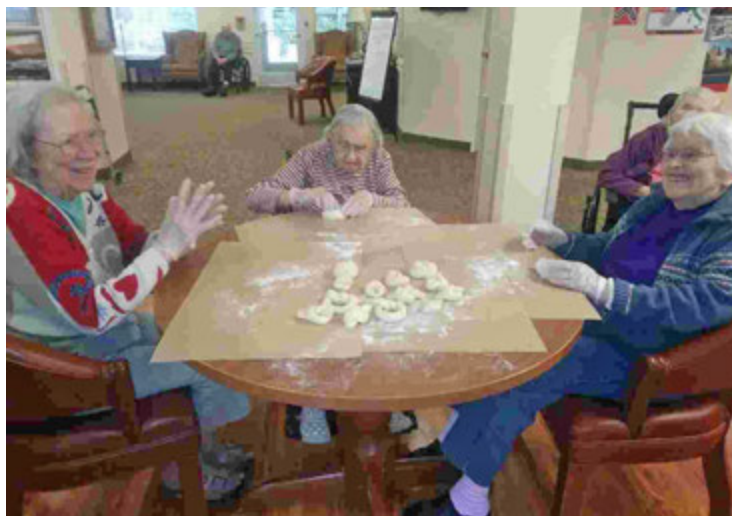
We made homemade German soft pretzels.