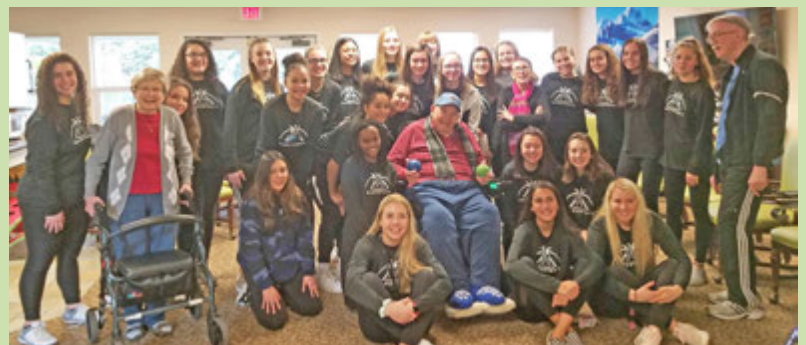
The girls and some residents

Our brand new high school had the Girls' Basketball Team visit our residents. We had so much fun. We did the chicken dance, painted pictures and played balloon badminton, cards and bocce ball. We also went around to some residents' rooms and sang. What a wonderful time.