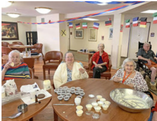
In France, we made coffee scrub and lavender body butter.