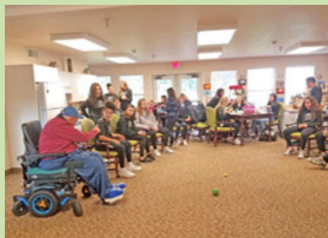
Bocce Ball time