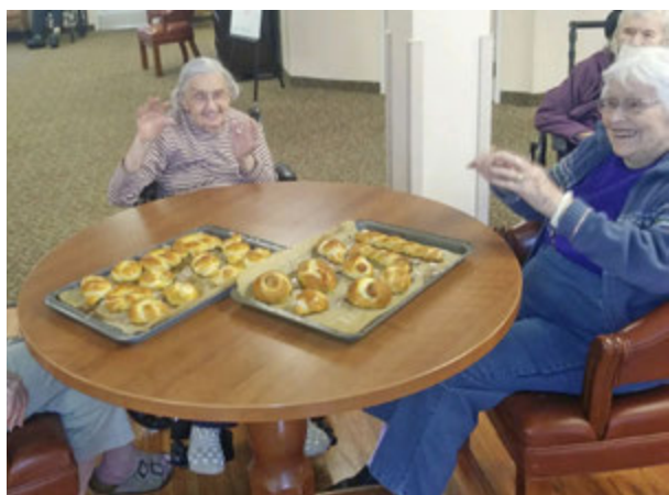
Our pretzels after they came out of the oven. Yum!