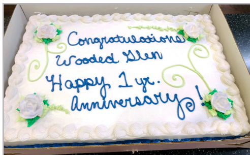
Wooded Glen celebrated our 1 year Anniversary with cake, games and family fun!