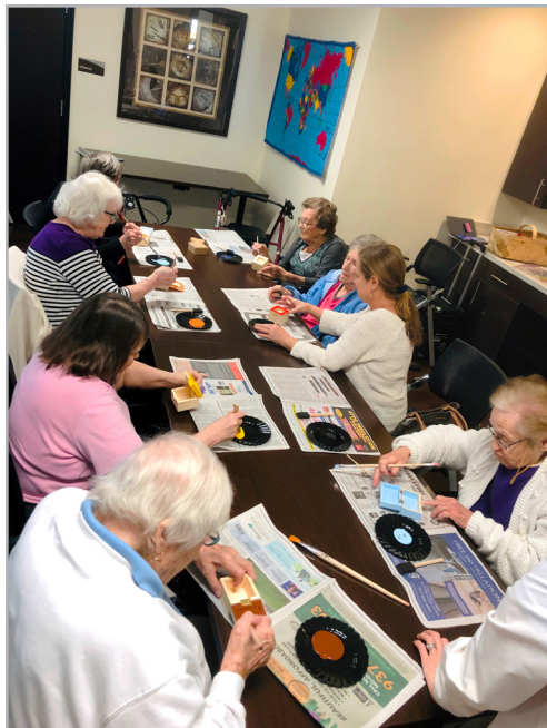
Crafting at Wooded Glen is another resident favorite!