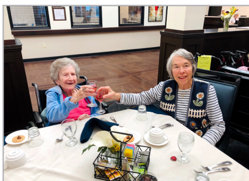
Happy Hour is always fun with friends, family and musical guests!