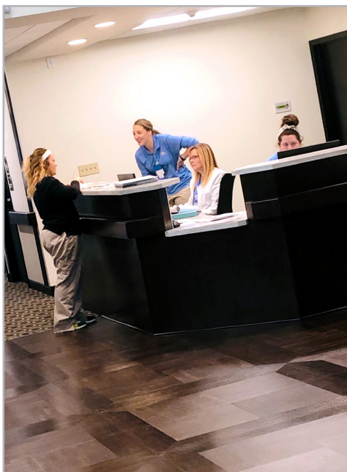
Our Nursing Team is second to none!