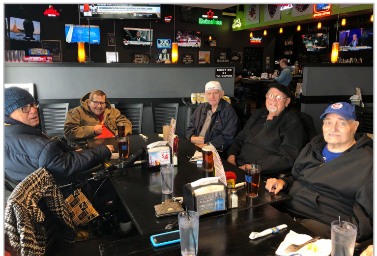
Men's Club at Stacked Pickle