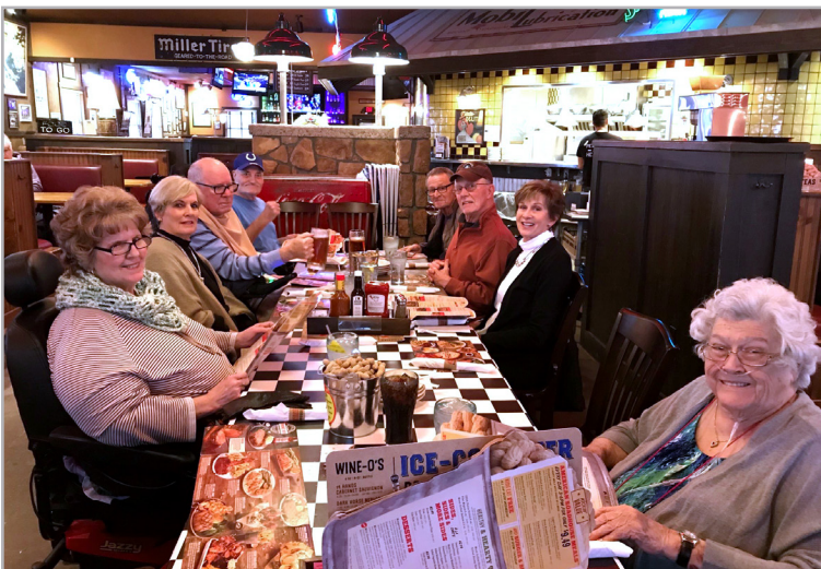
Residents at Logan's Roadhouse