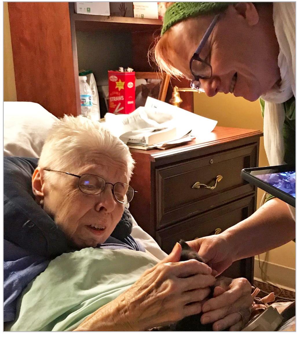
Pet Therapy Room Visits