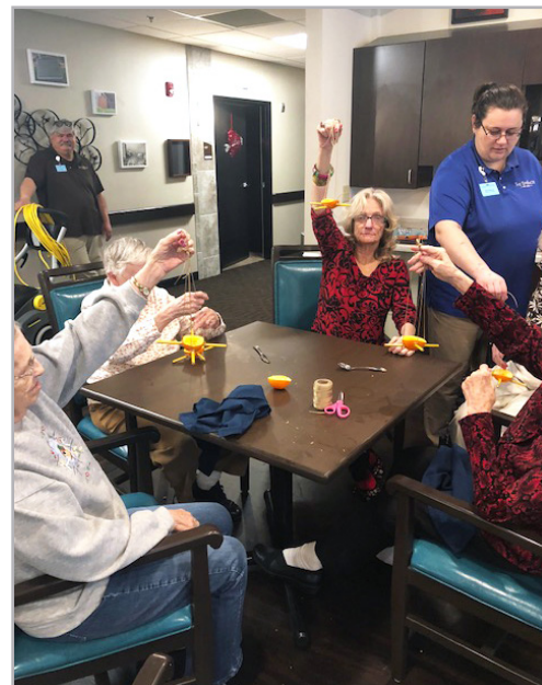
The Legacy Lane residents working on making bird feeders

Residents have been having a great time making a variety of crafts lately. During the bad weather we even took time to make bird feeders for our feathered neighbors to help them through the "arctic blasts". It's fun to see their creativity and individuality shine through as they put their own spin on each project. We even tried our hand at making homemade butter one day and everyone got to take turns shaking the cream for our final, very tasty, end results of delicious butter on our homemade bread!