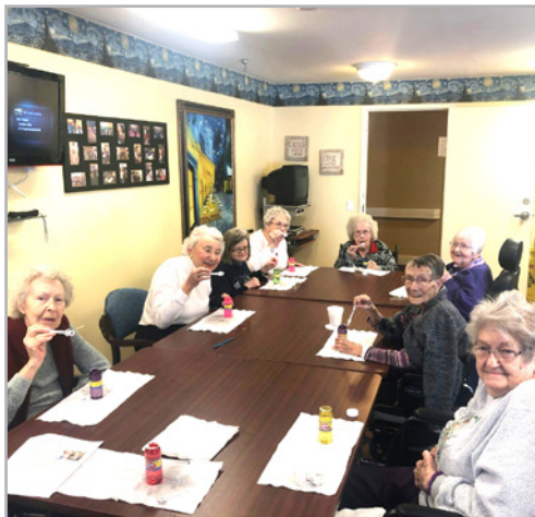
Breathing exercises with blowing bubbles!