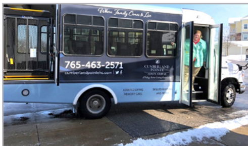
Our new bus is here!! Have you checked it out yet??