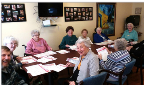
Thanks to everyone that comes every month to fold calendars!