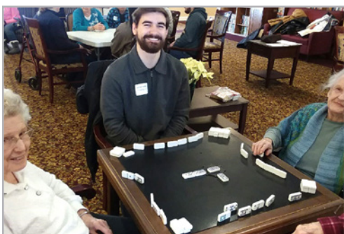
Thanks to Purdue Students for coming out to volunteer for MLK Day of Service!