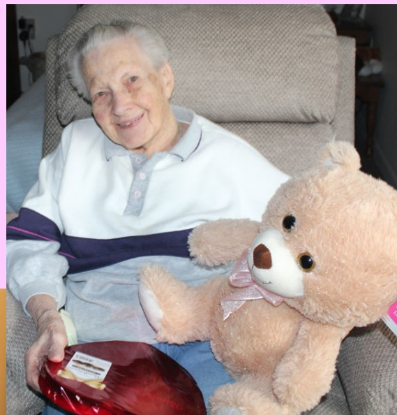
Most Traditional Betty A