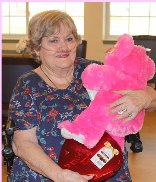
Most Romantic Margaret