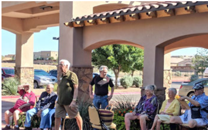
Can't wait for nice weather to be outside playing yard dice. Come on, spring!