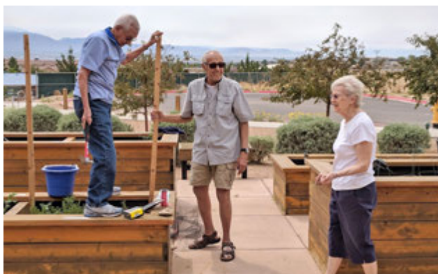
Setting up the Garden to bring fresh veggies for all to enjoy.