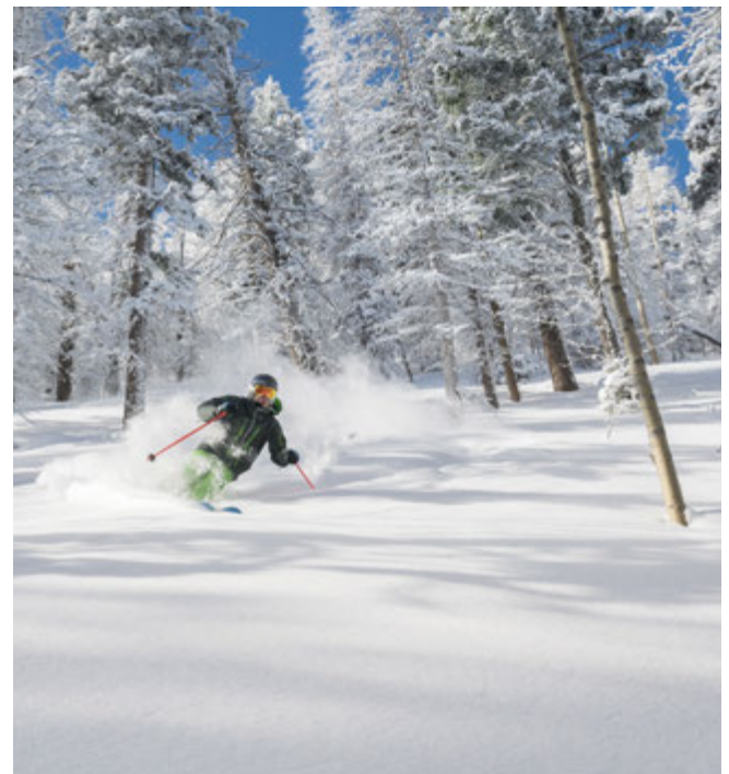
Skiing in Taos, New Mexico. Fun in the Snow!

With improvements in equipment, including the development of metal and fiberglass skis and the invention of the chairlift, skiing became easier and accessible to more people. It took off as a recreational activity, and ski resorts worldwide opened in response.