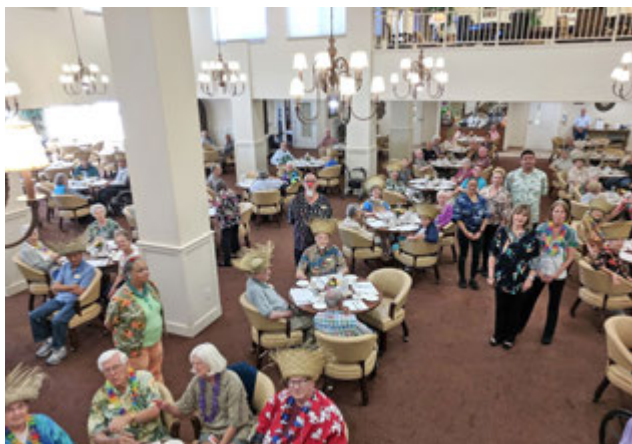
While the Managers are in Hawaii, let's have a party!