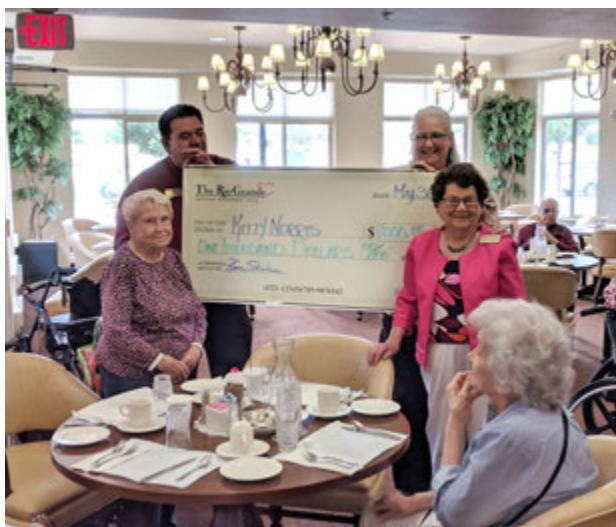
Referral checks a-flying at The Rio Grande.