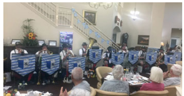
The Die Polka Schlinge Band to get our Polka on!

Hope to see everyone come out and have a great time!