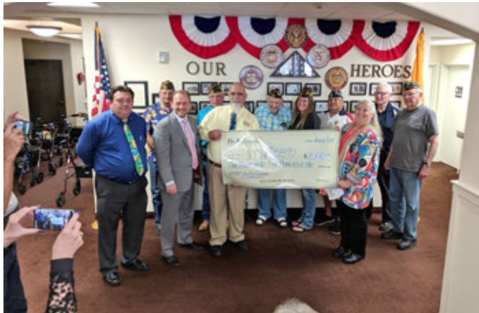
Helping the local VFW with a check raised by bringing great residents into The Rio Grande.