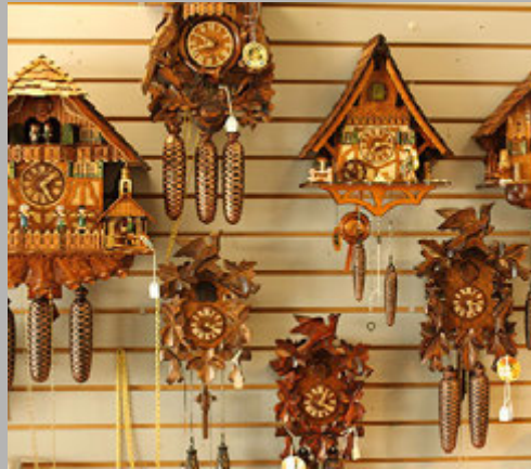
Cuckoo Clocks are a fun time piece of history.

the forest, then sold their creations in the warmer months.