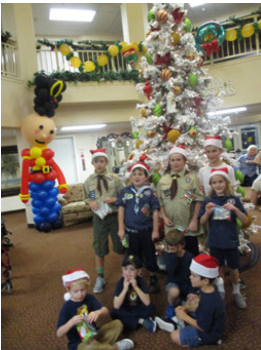
Such a great group of young boys!