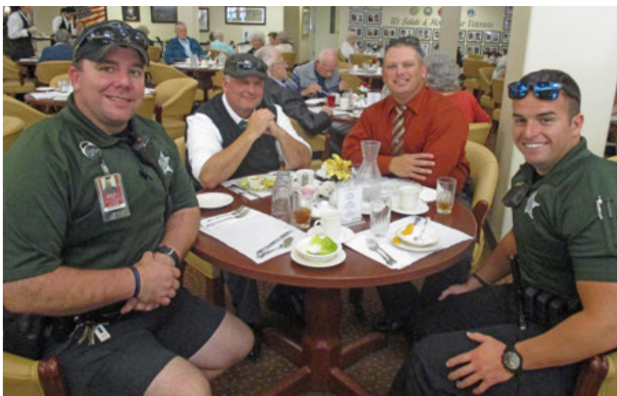
Hernando County's finest!

We are always thankful for the support we receive from our local deputies and are grateful to them for their service to our community!