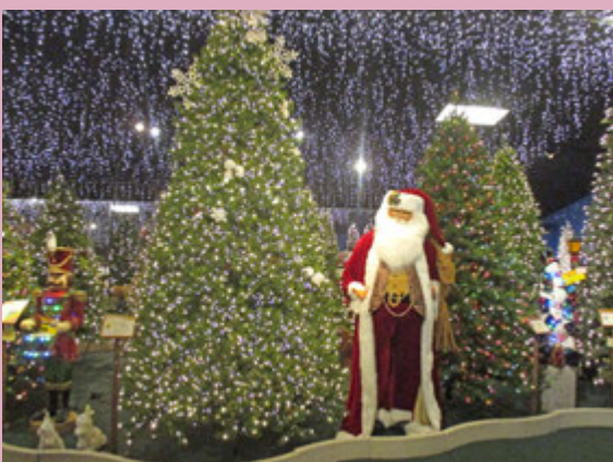
So many lights!