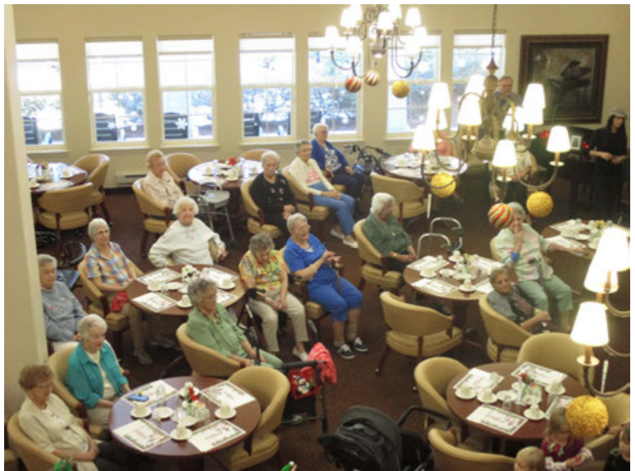
Our residents loved watching these kids perform.