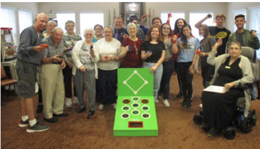
Salishan vs. Nature Coast