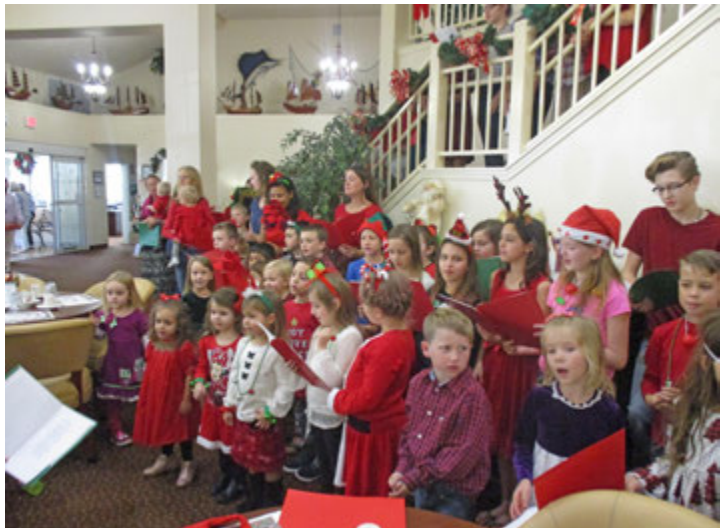
Home Circle of Hernando Carolers