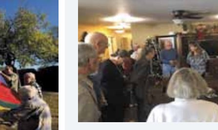
Catholic Visits 9:00am Saturdays

Weekends Church Services 1:30pm Sundays C7