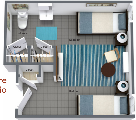
Memory Care Shared Studio