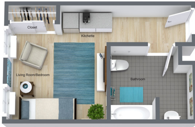
Assisted Living Studio