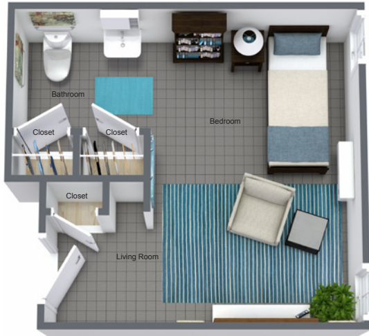
Memory Care Studio