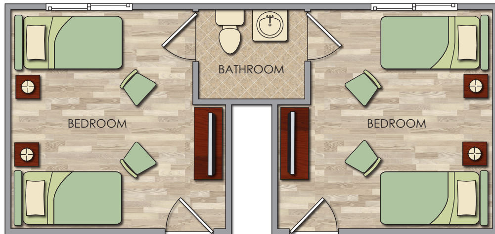
Shared Bedroom/ Shared Bathroom Apartment Home