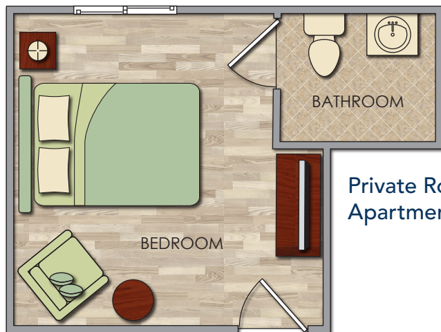
Private Room Apartment Home