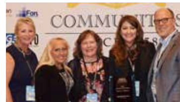
NORTHBROOK INN MEMORY CARE COMMUNITY