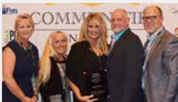
SADDLE BROOK MEMORY CARE COMMUNITY