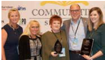
CEDARBROOK MEMORY CARE COMMUNITY