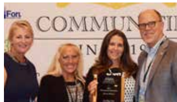
STERLING INN INDEPENDENT AND ASSISTED LIVING