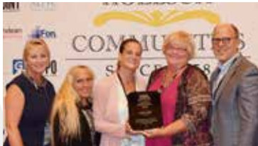
ARBOR HILLS MEMORY CARE COMMUNITY

In recognition of excellence in resident services that culminated in a perfect survey from their respective states.