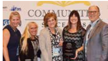
CANTERBURY INN DISTINCTIVE ASSISTED LIVING