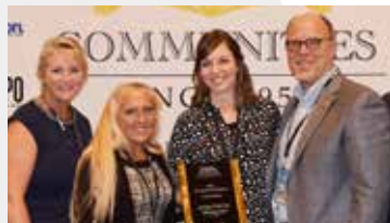
SPRING CREEK INN MEMORY CARE COMMUNITY