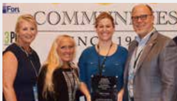
SILVER CREEK INN MEMORY CARE COMMUNITY