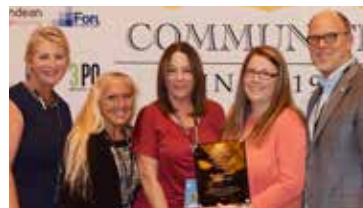
THE HAMPTON AT SALMON CREEK MEMORY CARE COMMUNITY