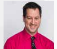
Cascade Inn Nino Cristoforo