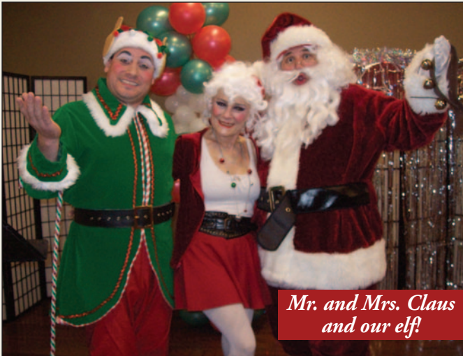
Mr. and Mrs. Claus and our elf!