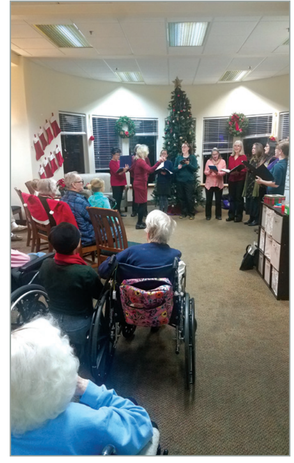
Redwood Womens Chorus