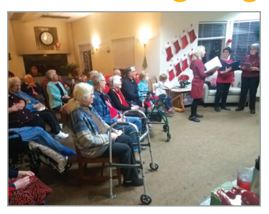
Group sing- a -long