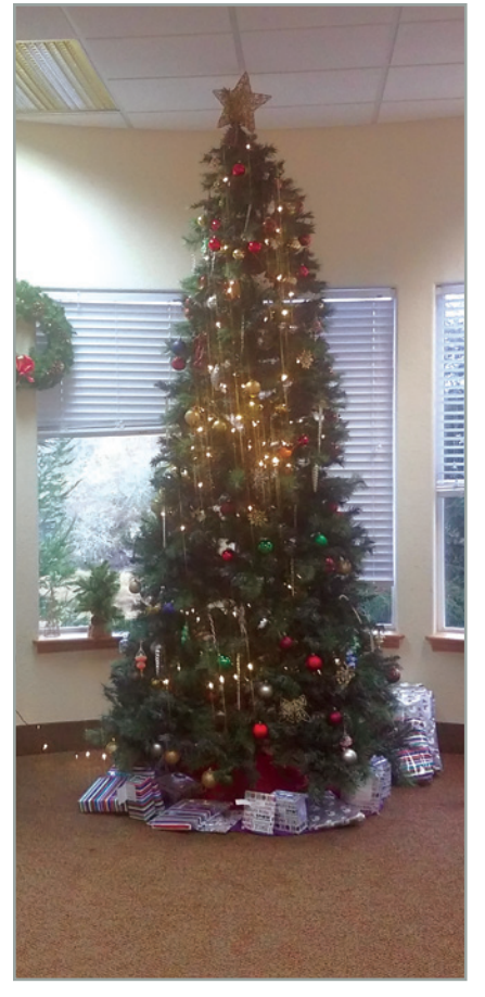
Our Christmas Tree