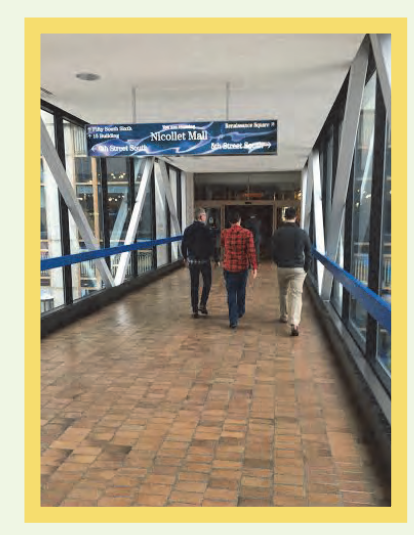
Invite a friend!

10:00 a.m.—Sit & Fit Exercise Monday – Sunday 11:00 a.m.—WALKING WITH LEGACY— Wednesdays.