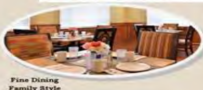
Fine Dining Family Style