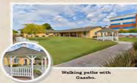
Walking paths with Gazebo.