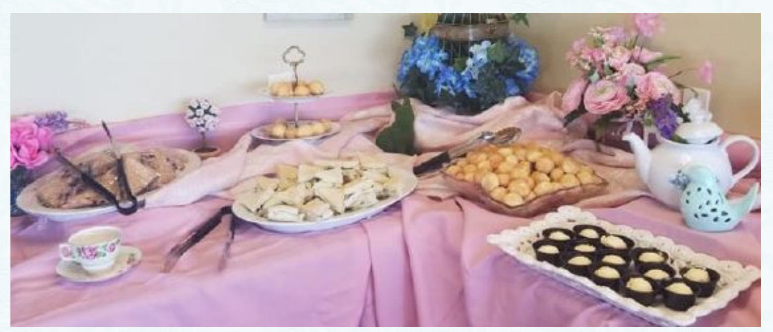
Mother's Day Sweets & Treats

Fresh Vegetables Fresh Fruits Fair Style Food Chili Baked Potato Swedish Meatball Meatloaf Daily Soup Specials