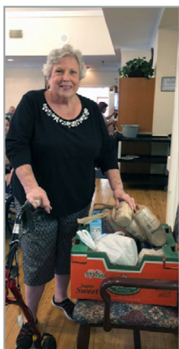
Can food drive