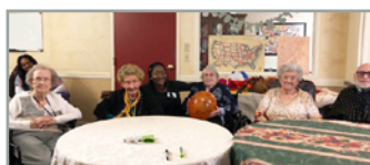
Get to know you