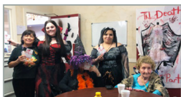
Costume Contest and Door Decoration winners