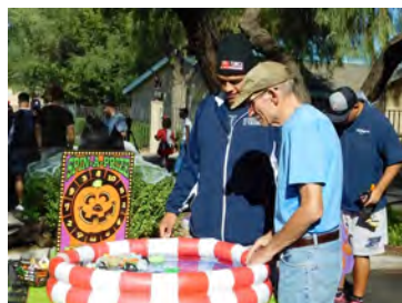
Halloween Carnival 2018