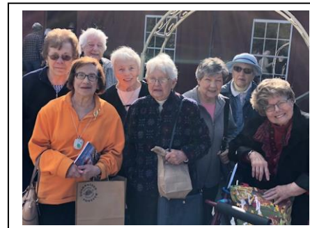
Vermont Country Store Outing. Scenic Ride & Shopping

October is always the month we love to remember for its colorful entrance and spooky exit. Although Halloween usually is a time to see a lot of us out in costume, especially the little ones running around in the dresses and superhero outfits. The big kids had our fun too. What a nice day it was on Halloween with our residents and staff, did you guess who was who?