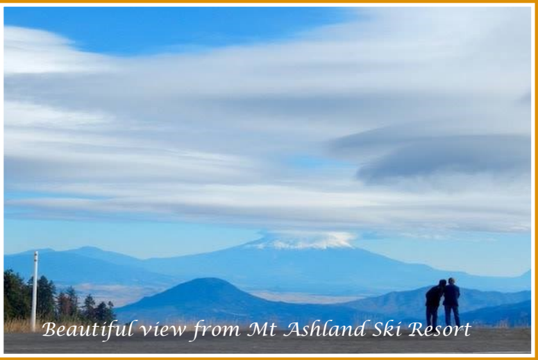
Beautiful view from Mt Ashland Ski Resort