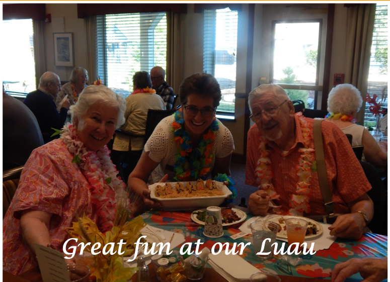
Great fun at our Luau