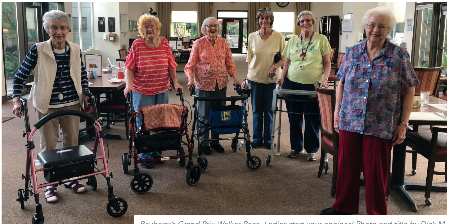
Bayberry's Grand Prix Walker Race..Ladies start your engines!