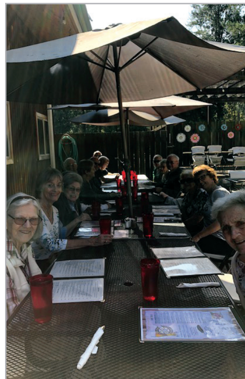
Such a fun group of residents