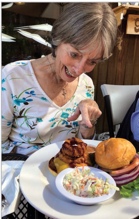
Deanne may need a to go box!

What a beautiful drive and wonderful lunch!