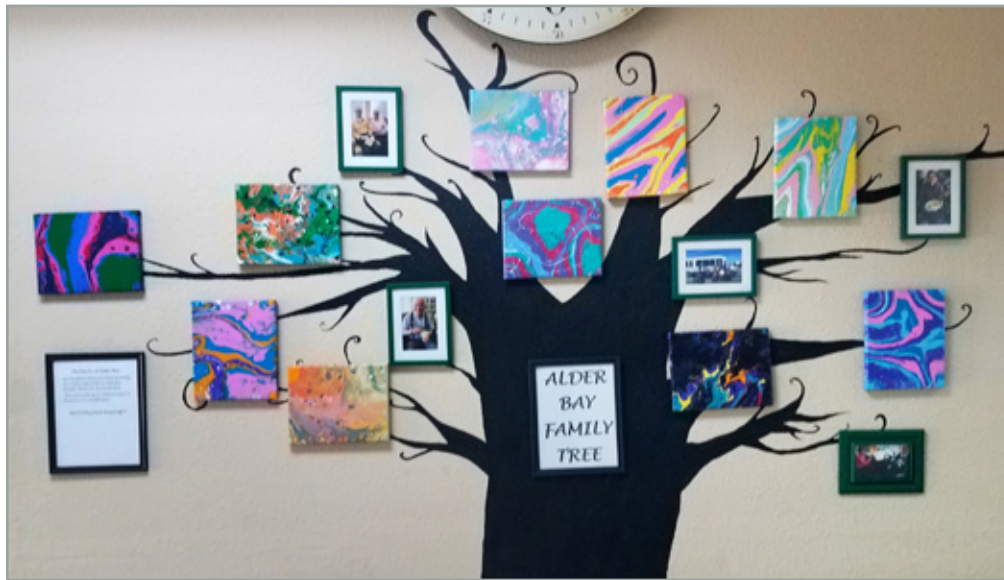
Family Tree Art