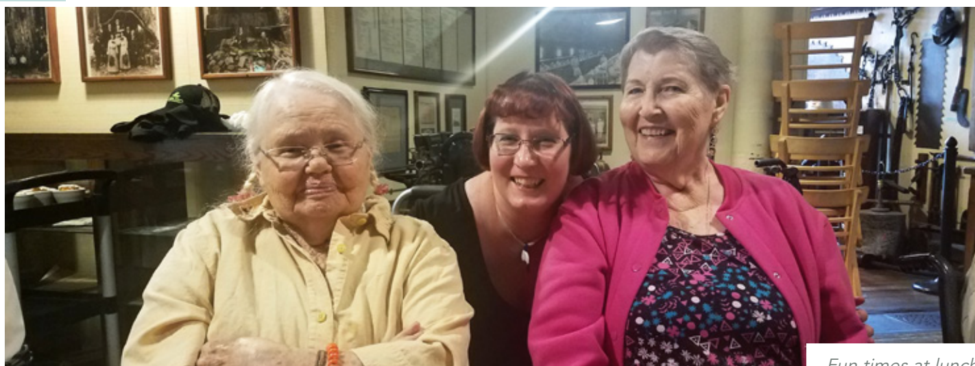
Fun times at lunch.