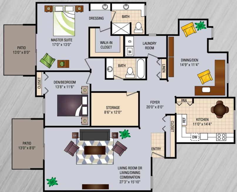
FIRST LEVEL UNIT