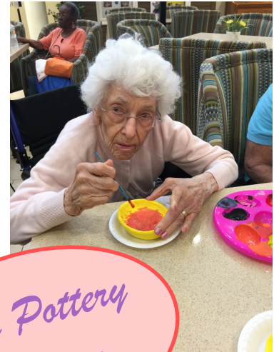
Clay Pottery Painting