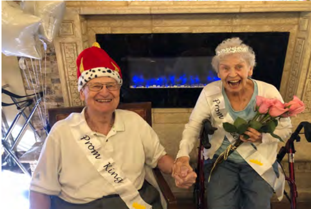
King & Queen The