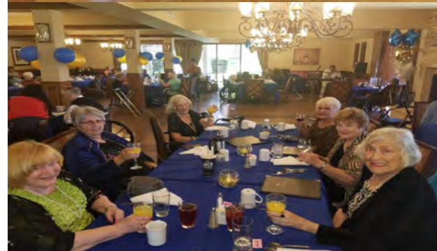
Residents Enjoying Prom