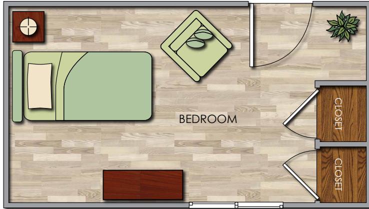
Memory Care Private