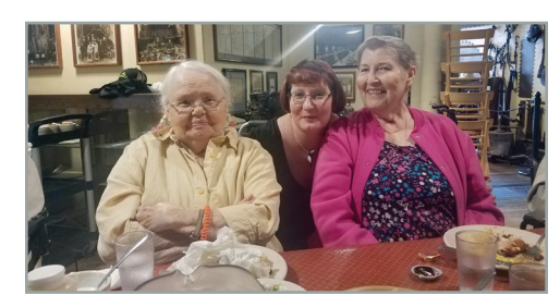
Lunch out with good company.