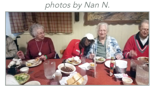
Staff getting sleepy after lunch