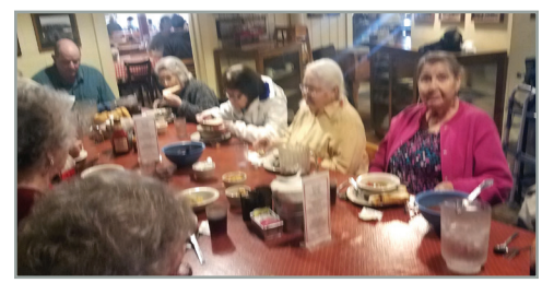
Great food at the Samoa Cookhouse