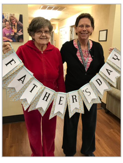
Dads day banner