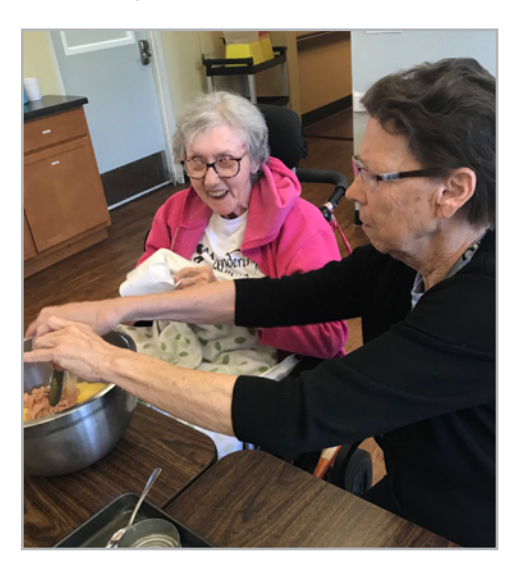
Friends making cat treats!