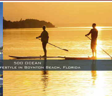
500 OCEAN LIVE THE LIFESTYLE IN BOYNTON BEACH, FLORIDA