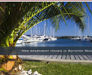
NEW APARTMENT HOMES IN BOYNTON BEACH, FLORIDA