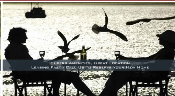
SUPERB AMENITIES, GREAT LOCATION LEASING FAST - CALL US TO RESERVE YOUR NEW HOME