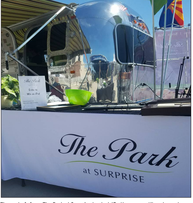
Three chefs from The Park at Surprise bested 45 other competitors to capture "best in show" for their culinary entries at the fifth annual Taste of Surprise at Surprise Stadium.

The Rotary Club of Surprise hosted the Taste of Surprise and showcased 46 restaurants which served 1,600 mouth-watering attendees. The event also featured 12 beer, wine and spirit