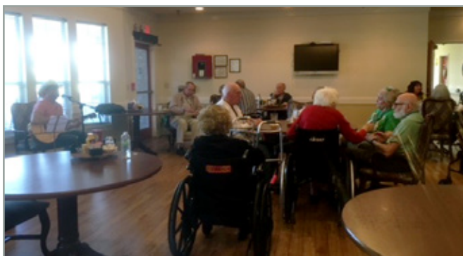
Family Night Fun