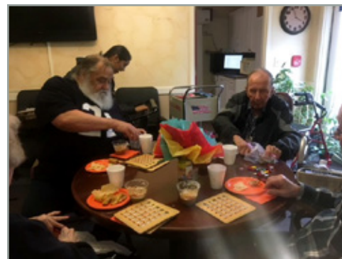
Cinco de Mayo Celebration