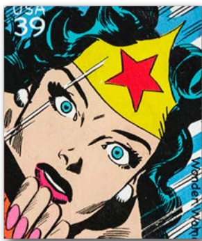
William Moulton Marston, Wonder Woman's creator, also invented the lie detector.

We're calling the month of June wonderful, super, and heroic. Forgive the use of superlatives, but June celebrates both Wonder Woman Day on June 3 and Superman Day on June 12.