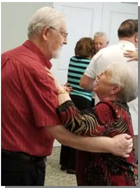
Put your dancing shoes on!