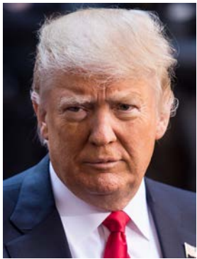
Donald Trump, 45 th President of the United States.

In astrology, those born between June 1–20 are Gemini’s Twins. They have two distinct sides to their personality: sociable and ready for fun, or serious and thoughtful. Sometimes they feel as if one half is missing, so they forever seek new friends. Those born between June 21–30 are Crabs of Cancer. Guided by their hearts, Crabs are deeply emotional and nurturing. They create comfortable homes and always welcome people into their circle.