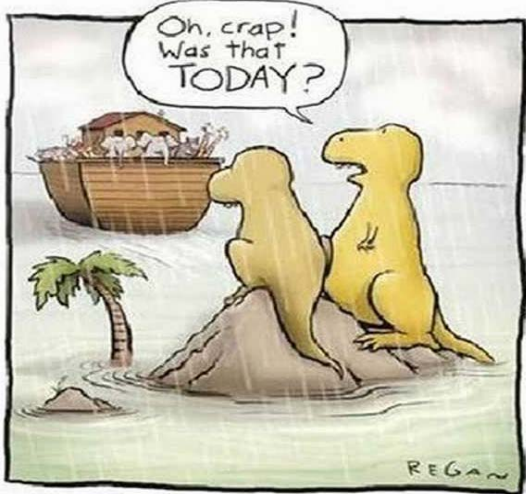
The first senior moment.

When Helen Keller was born on June 27, 1880, no one knew she would grow into a famous advocate of the blind and deaf. Her life story, nonetheless, has inspired countless people. Keller was not born deaf or blind. She lost these senses after contracting a childhood fever. She lived an isolated and frustrating childhood, imposed on her by her inability to communicate. It was a teacher, Anne Sullivan, who broke through this barrier. For 49 years, Sullivan and Keller worked as teacher and pupil. Keller became the first deaf and blind person to