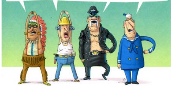
The Retirement Village People