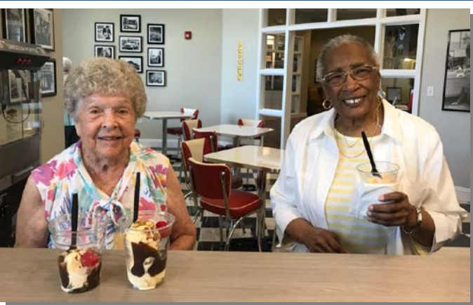
We always enjoy Ice Cream Socials especially when it's hot fudge sundaes!