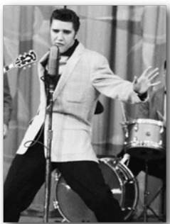
Elvis may have been famous for his black hair, but he dyed it from his natural brown.

On June 5, 1956, a young and charismatic musician named Elvis Presley appeared on The Milton Berle Show . While this was not Elvis' first television appearance, and not even his first appearance with "Uncle Miltie," his rendition of Hound Dog became at once both famous and infamous. Before this performance, Elvis was often captured on camera playing his guitar from the waist up. However, for Hound Dog , the