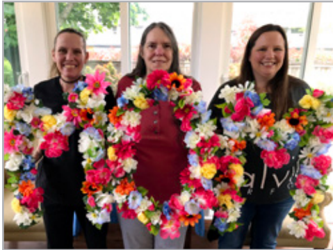
Violet and daughters on Mother's Day