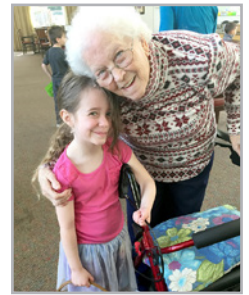
We all loved our visit with this cute bunch from Kiddz Learning Center!