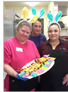
Veronica, Amber & Lulu are the cutest bunnies!