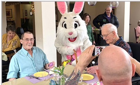
Easter Fun with a special guest