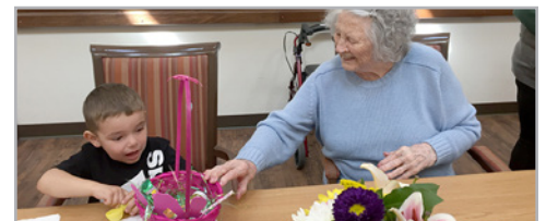
We all loved our visit with this cute bunch from Kiddz Learning Center!