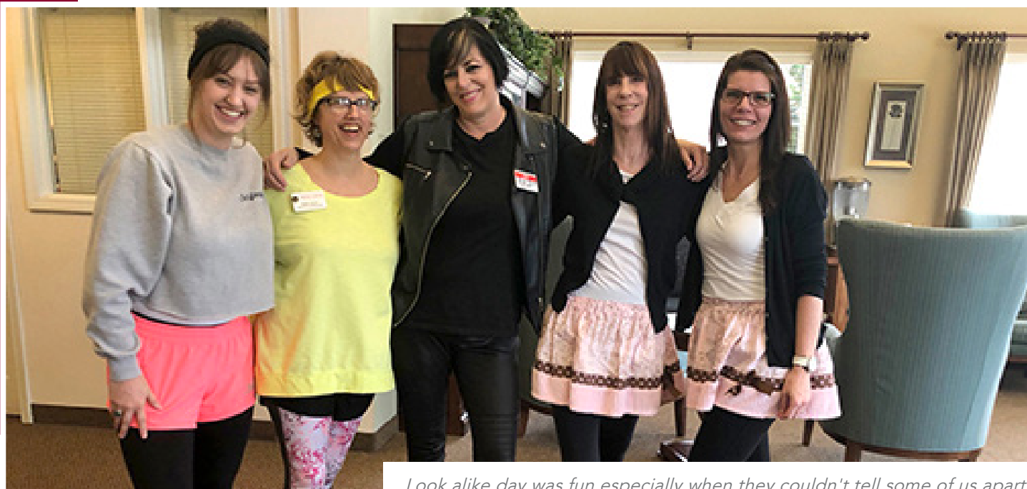
Look alike day was fun especially when they couldn't tell some of us apart!