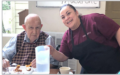
Lulu serving the residents with lots of love!