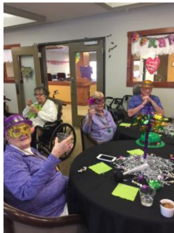
Our King & Queen!