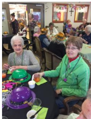
Mardi Gras Fat Tuesday Celebration!