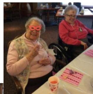
Valentine's Day Fun!