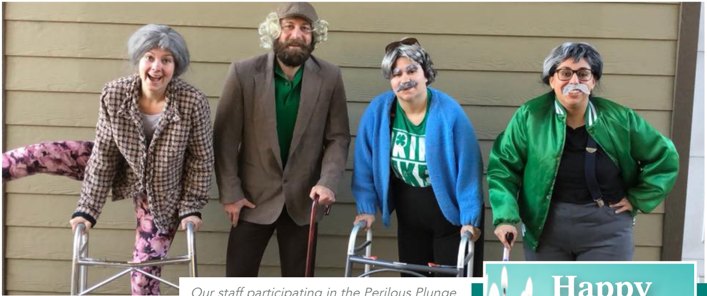
Our staff participating in the Perilous Plunge