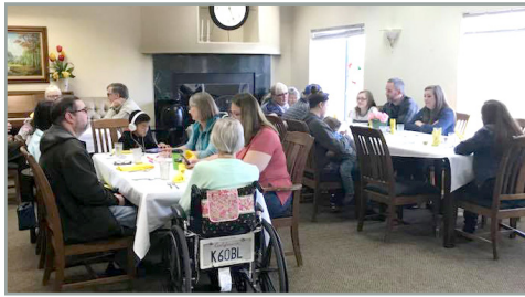
Guests at Easter Lunch