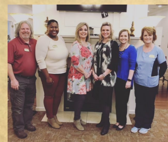
Anderson County Chamber Coffee