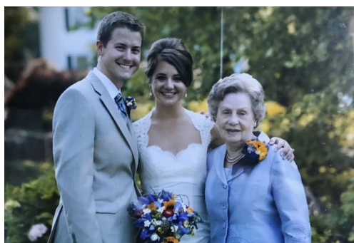
Hardworking Caring Mother