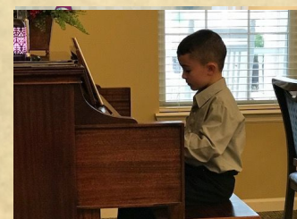
Temple Baptist Fellowship Service