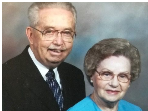
Loving Wife and Mother