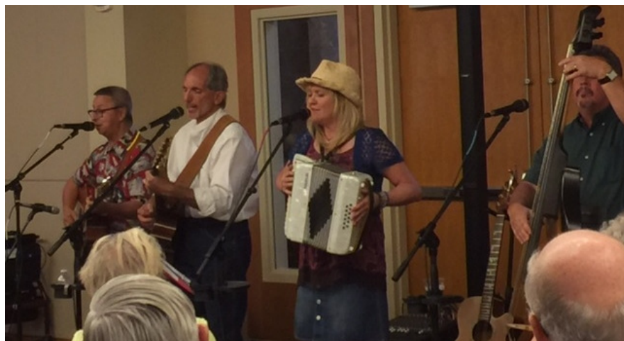
Holly Creek residents enjoy a recent concert by the group Dakota Blond. The concert was made possible through donations to the Cottager Music Series, which is staging quarterly special musical presentations.

Did you know that CLC in 2016 received more than $29,000 to directly support enriching opportunities at our communities?