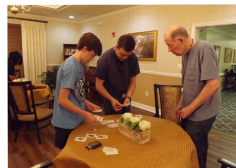
Valentine's Day! T.C.A.T.

A very busy Valentine's Day ended with a BOARD GAME party after dinner. Flowers were handed out along with sweet treats and more cards while our visitors from The Church at Tuscaloosa played UNO, Dominos, Chinese Checkers and Chutes and Ladders. We even enjoyed a magic trick card show!