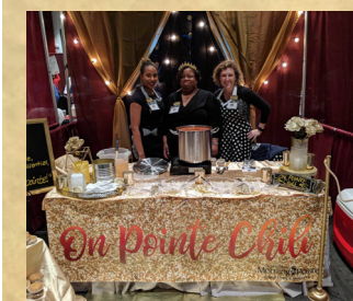
The Chili Cook Off The chef and crew