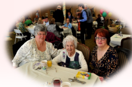
Easter Brunch 2017

Please join us for our Annual Easter Brunch March 24, 2018. There are two seating's available 10:00 a.m. and 12:00 p.m. Also, planned between seating's at 11:30 a.m. is an Easter egg hunt for the children. This is a wonderful event and a great way for families to celebrate the upcoming holiday together. As many of you have attended last years brunch, this years event promises to be just as special as past years; delicious dishes will be served, entertainment, fun for the kiddies and much more. Please R.S.V.P. by March 19, 2018, as there is limited seating. Please sign up at the IL front desk. Hope to see you there, and may you and your family be filled with many blessings this holiday season!