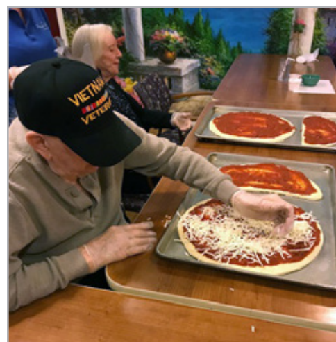
Memory Care making pizza