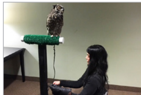
We had an educational & fun presentation from the Raptor Center.