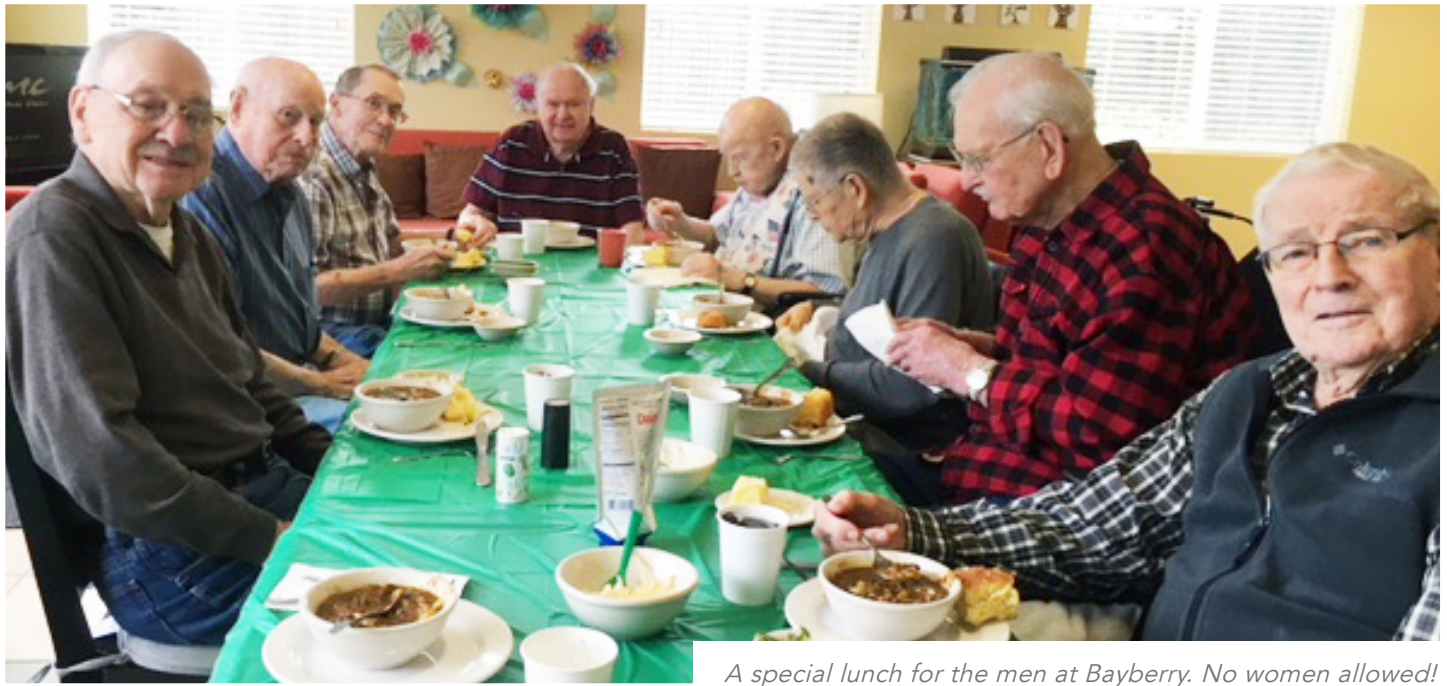
A special lunch for the men at Bayberry. No women allowed!