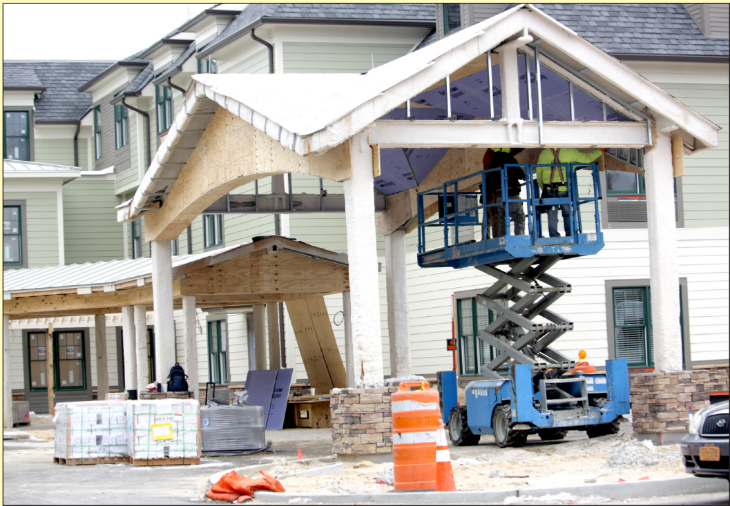
HOME SWEET HOME: While work crews put the finishing touches on the exterior of the building (above), bedrooms at the Whisper Woods assisted living facility in Smithtown have been staged for display to prospective residents.