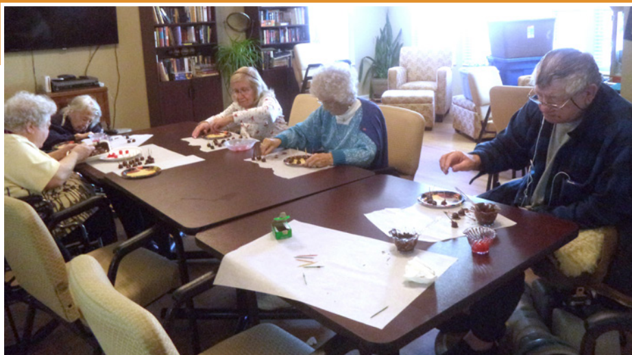
Making chocolate covered cherries Ummmmmm!!